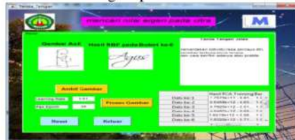
Figure 13. Results of the identification of the 9th type of Signature Form

From the GUI display, by inputting the signature data from the training image and filling the column in accordance with the provisions of max epoch = 10, and learningrate = 0.01, then the signature image can be crossed so as to produce a signature form that is in accordance with the specified characteristics. An example of the results of the introduction can be seen in Figure 14 with the 9th image input and Figure 15 with the 13th image input.