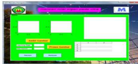
Figure 12. Display the character recognition GUI

In this step simulation is carried out to apply the completion of a person's character recognition through the form of signatures using the radial basis function (RBF) method using MATLAB. GUI results for character recognition can be seen in Figure 13.