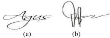
Figure 1. Sign Form (a) Clear, (b) Unclear

Someone who has an easy-to-read signature shows confidence, is open (extroverted), straight forward, and how to think as is or practical. Conversely in Figure 1, if the signature is made complicated and abstract so it is difficult to read indicating the owner is closed, good at keeping secrets and tends to lie. Nevertheless, from the positive side a person is very careful in acting [8].