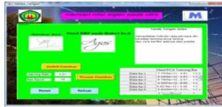
Figure 14. Example of the Results of the Recognition of the 13th Signature Form

From the 50 signature images obtained, it can be seen the results of the PCA as well as the results of character recognition with the Radial Basis Function Neural Network (RBFNN) method. The results of simulating a person's character recognition through signature forms can be seen in Table 1.