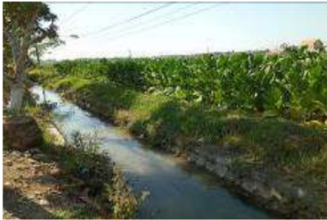
Figure 2. Wetland tobacco