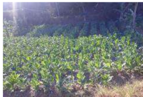
Figure 4. Upland tobacco