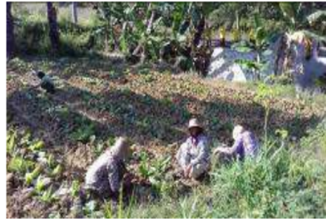
Figure 3. Dryland tobacco