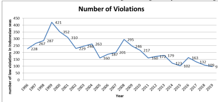
Figure 2. Data trend of violations of law in Indonesian seas 1996-2019

Data on the number of law violations in Indonesia's maritime territory from 1996 to 2019 can be seen in Table 1. The data on the number of violations shows a decreasing trend throughout the year as shown in Figure 2.