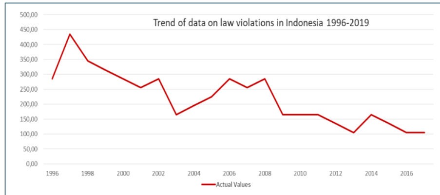
Figure 3. Fuzzy time series results

The output data from the fuzzy time series forecasting will be used as forecasting data using the Double Exponential Smoothing method with the Holts model.