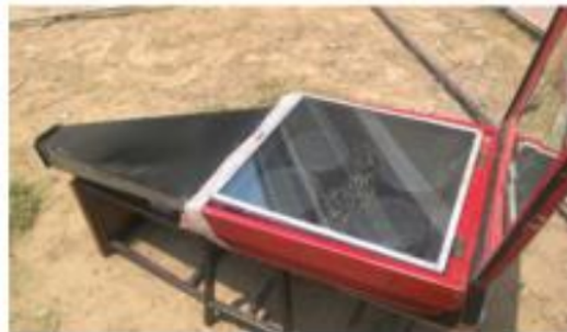
Figure 2. Hybrid box-type solar cooker (SBC) (Saxena & Agarwal, 2018)

cooking. Five solar panels of 15 W each are installed on this cooker. The design of this hybrid box solar cooker includes the right size of solar panels, batteries, and DC heaters. The efficiency of this hybrid solar cooker was found to be 38%. Other studies (Saxena & Agarwal, 2018) have also found that box-type solar cookers can function well in various climatic conditions. Another study in Uttar Pradesh, India, tested a box hybrid solar cooker with additional trapezoidal channels and other integrated elements. The test results showed that the thermal efficiency of this solar cooker reached 45.11% with a power consumption of 210W. Thus, this type of cooker can cook food efficiently in poor indoor conditions.