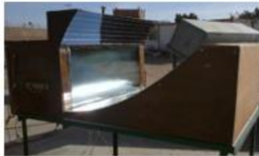
Figure 6. Box-type solar cooker with optogeometric concentrator (Harmim et al., 2012)

out the top duct to transfer heat flux to the food or water in the pan placed on the floor. This configuration creates a hot current that circulates within the stove box. Thus, this type of solar cooker can be used for cooking using solar energy (Harmim et al., 2012).