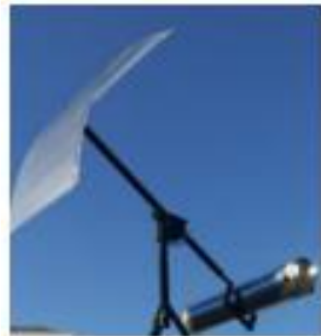
Figure 7. Portable solar cooker using Fresnel lens (Zhao et al., 2018)

Research has been conducted to develop panel-type solar cookers and the latest portable solar cookers. The panel-type solar cooker is equipped with a compound parabolic concentrator (CPC) on the edge of the cooker to collect solar radiation. The energy efficiency obtained reached 34% when using a water load of 3.5 kg and a specific boiling time of 22.58 minutes (Goyal & Eswaramoorthy, 2023a). It has been studied previously (Zhao et al., 2018) that a new portable solar cooker with a Fresnel curved lens, a concentrator can facilitate manual tracking of solar radiation at zenith and azimuth angles. In performance testing, the solar cooker was able to achieve the highest average temperature of about 361°C when irradiation was carried out with an intensity of 712 W/m 2 . The maximum energy efficiency of the system was 22.6% when cooking pork. All types of food cooked with this solar cooker reached the food-grade standard. The results of this study show progress in the development of efficient solar cookers that can be used for cooking with solar energy.