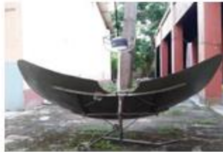
Figure 5. Activated carbon coated aluminum parabolic type domestic solar cooker (Goswami et al., 2019)

In their research (Amri et al., 2020) designed a half-cylindrical parabolic type solar cooker with a diameter of 43 cm x 63 cm, having various absorber materials, namely aluminum, copper, and brass with a diameter of 41 cm x 61 cm and thickness of 0.02 mm. The highest water temperature was obtained on the brass absorber solar stove in the 5th test at 80.25 °C at 12:10 a.m., and on the 4th day of testing the highest cooking power was obtained on the aluminum absorber solar stove of 18.46 W. The highest stove efficiency obtained on the aluminum stove in the 1st test of 25.57% at 13:10 a.m. WIB. The results of this study are similar to research (Goswami et al., 2019) obtained the maximum energy efficiency value on a parabolic-type solar cooker made of activated carbon-coated aluminum pan of 22% at 12.45 WIB. This shows that the efficiency value produced is influenced by the intensity of solar radiation.