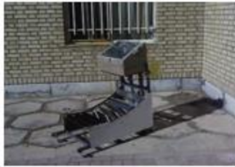
Figure 4. Parabolic type solar cooker with three mirrors (Zamani et al., 2015)