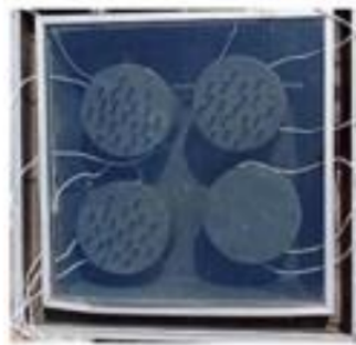
Figure 3. Box-type solar cooker with added aluminum fins (Vengadesan & Senthil, 2021)

This research (Vengadesan & Senthil, 2021) discusses the development of a box-type solar cooker using fins and heat storage media to improve its thermal performance in tropical countries. In the first study, the box-type solar cooker was fabricated using four cylindrical aluminum vessels with and without fins having varying fin lengths. Test results showed that the 45 mm finned configuration provided a thermal efficiency of 56.03% and a heat transfer coefficient of 58.54 W/m 2 °C. The second study (Kumar et al., 2022) explored the use of hollow capsules and PCMs in combination with box-type solar cookers. The results showed that the combination of a box-type solar cooker with encapsulated PCMs resulted in an increase in thermal efficiency, heat transfer coefficient, cooking power, and an overall decrease in heat loss coefficient. The box-type solar cooker was shown to meet Bureau of India (BIS) standards and has the potential to be further developed.