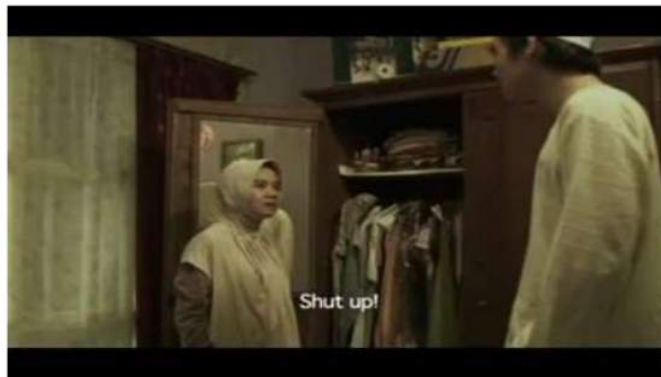
Figure 6. Scene 78

Ratna represents a woman who is pious, tough, strong, and steadfast in the face of all the trials of life that he experiences. In the feminism theory group, then Ratna belonged to a radical group or sect. Where is Ratna inside facing every problem in his life is always firm and never wants to be considered helpless.