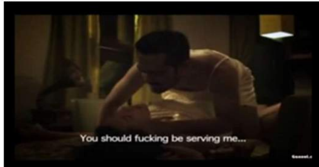
Figure 3. Scene 7 & 83

Scene 7 begins with Rendi growling while demonstrating such pregnant woman who then throws the pillow that is used to imitate her befits pregnant woman towards Lili who tied him on the dining table. The intimate scene between Lili and Rendi is accompanied by violence, in which Rendi always vents his desires in a rude way to Lili. This scene indicates that Lili is powerless to fight against the violence committed by Rendi, which results in Lili always got bruises on his face and body. The scene of beating, watering down Lili's face, with Rendi on top of Lili. Supported with full shot shooting shows the whole scene, then the low angle shot and dim lighting further complement the marker in representing Lili as a woman who is weak, helpless, and downtrodden.