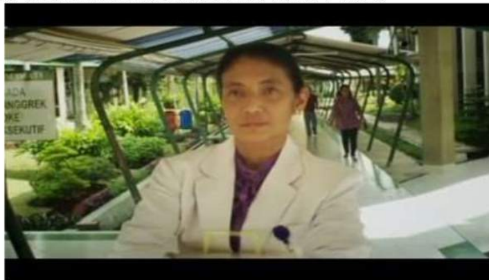
Figure 1 . Scene 38 of Dr. Kartini in the movie 7 hati 7 cinta 7 wanita